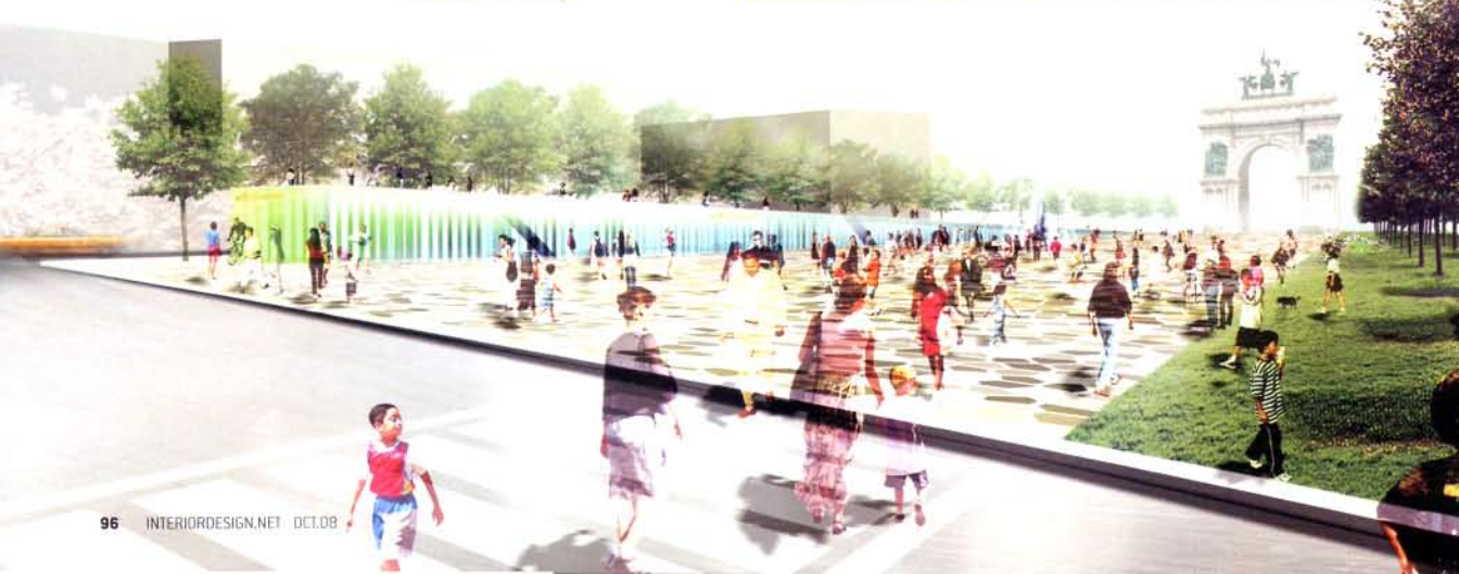
Clockwise from top left: The scheme for Canopy, one of the two winning preliminary Grand Army Plaza designs. Competition entries individually displayed in 8-foot cubic kiosks. The cross section of Please Wake Me Up, the other winning design. Sketch Model, seen in the trust's "Taxi 02" organized for the 2007 New York International Auto Show. A rendering of the pedestrian esplanade envisioned in Please Wake Me Up.

The enthusiasm of elected officials when the Plaza ideas were presented in September was a sign that it's already a compelling project. Indeed, the Trust's systematic inclusion of public agencies, neighborhoods associations, and design professionals at every programming stage is a guarantee of its efficacy. "It's always a dialogue—that's sacrosanct to the Design Trust," Woodner notes. After accepting